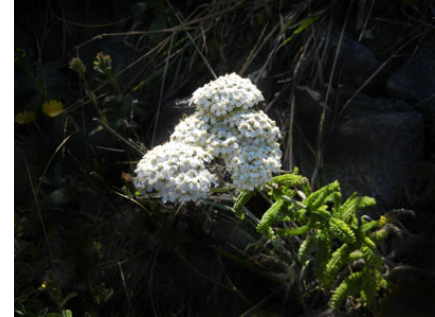
Figure 1. The yarrow plant with its stalk and flower. Photo: G. Haynes, 2013.

“One takes fifty yarrow stalks, of which only forty-nine are used. These forty-nine are first divided into two heaps (at random), then a stalk from the right-hand heap is inserted between the ring finger and the little finger of the left hand. The left heap is counted through by fours, and the remainder (four or less) is inserted between the ring finger and the middle finger. The same thing is done with the right heap, and the remainder inserted between the forefinger and the middle finger. This constitutes one change.