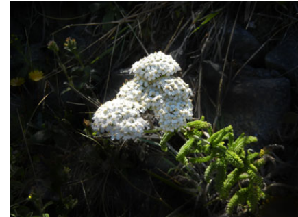
Figure 1. The yarrow plant with its stalk and flower.

“One takes fifty yarrow stalks, of which only forty-nine are used. These forty-nine are first divided into two heaps (at random), then a stalk from the right-hand heap is inserted between the ring finger and the little finger of the left hand. The left heap is counted through by fours, and the remainder (four or less) is inserted between the ring finger and the middle finger. The same thing is done with the right heap, and the remainder inserted between the forefinger and the middle finger. This constitutes one change.